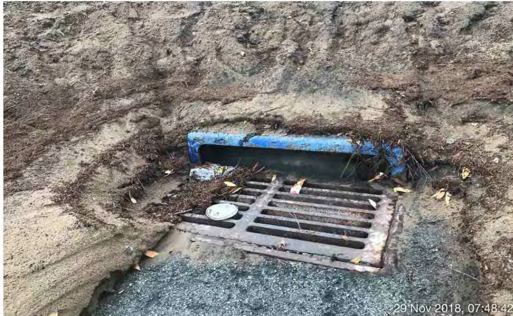
Photo 6. High water mark at pond outlet structure, 11/29/18