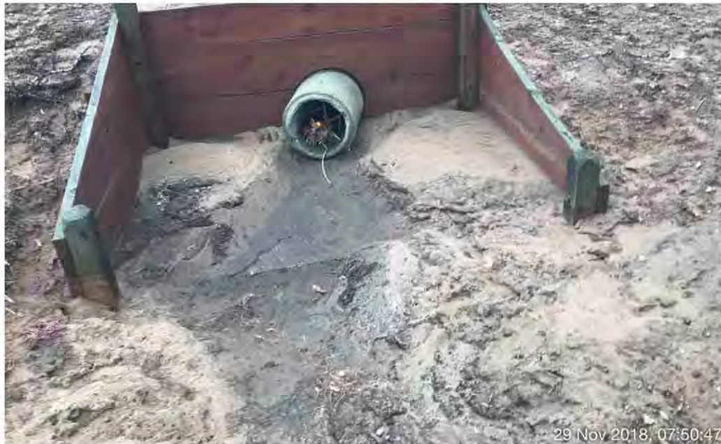
Photo 8. Scour at pond inlet pipe, 11/29/18