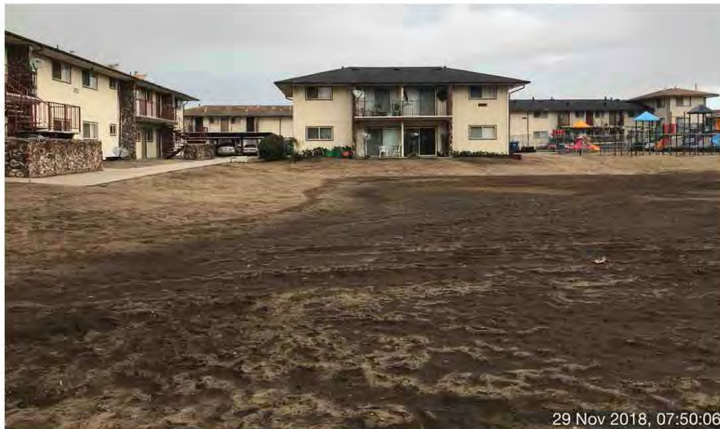
Photo 7. Debris deposition across pond bottom, 11/29/18