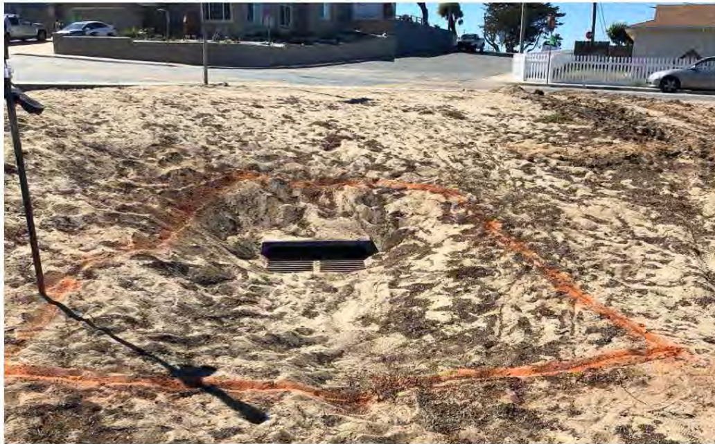
Photo 1. Pond outlet structure and approximate limits of buried AC apron, 10/16/18

The pond outlet structure consists of a catch basin located at the southwest corner of the pond. The catch basin grate is at elevation 109.4'. The structure was clogged with soil (sand) during our initial site visit in October 2018. City crews subsequently cleaned out the inlet. The catch basin was clear and functioning during the first storm of the season in November 2018.