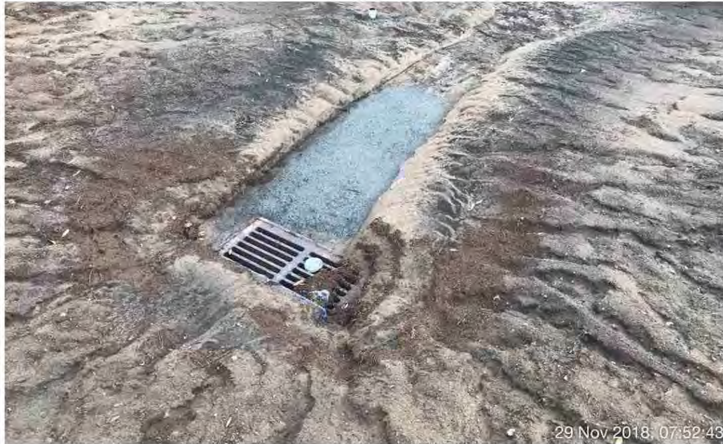
Photo 5. Pond outlet structure, 11/29/18

The following day (11/29/18 at 7:50 am) we again reviewed the pond. There was a high water mark at the pond's outlet, 9 inches above the pond outlet's grate (approximately elevation 110.2'). We also noted more soil erosion downstream of the pipe outfall than was observed the previous day. These observations indicate that more flow had entered the pond than the previous day; and because the outlet structure has a capacity of over 10 cfs at 9" depth, the storm drain system either "backed up" at SDMH #6 to approximately elevation 110.2', or the inlet was clogged.